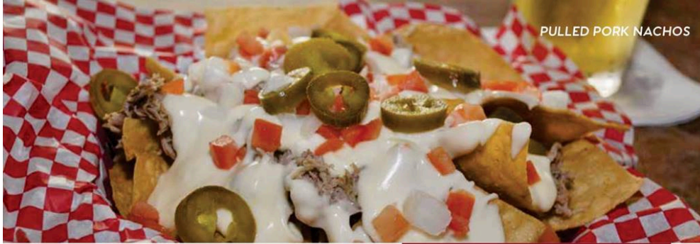
PULLED PORK NACHOS